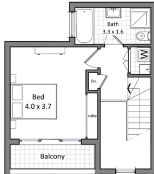
First level floor plan